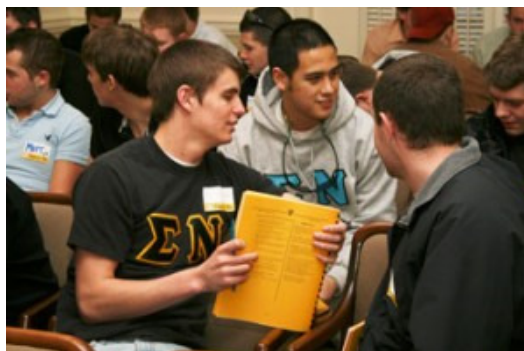
Participants exchange ideas between sessions during the Sigma Nu Institute in Lexington.

The Sigma Nu Institute is the Fraternity’s officer training initiative, which was first implemented as a pilot program in January 2006. Twenty-four Commanders from chapters across North America were invited to take part in the inaugural program held at the Fraternity’s Headquarters in Lexington, Virginia.